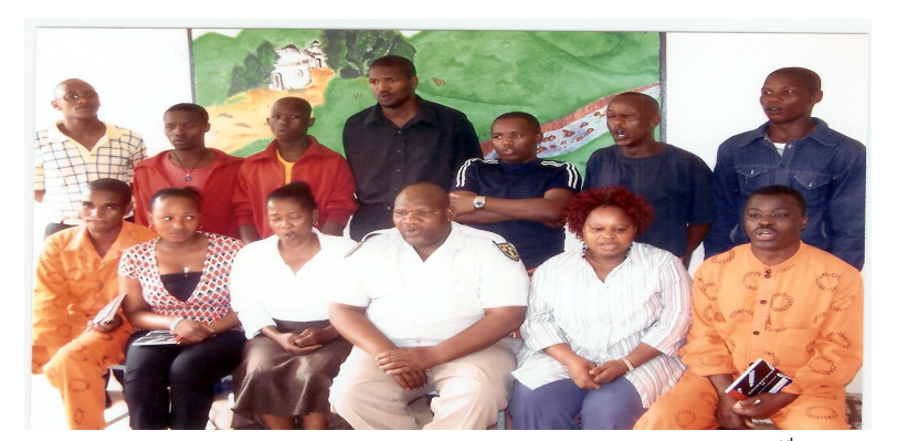
Fig 2 – 13 of the 16 action research leaders with the facilitator (front row2<sup>nd</sup> from the right hand)

Research (learning) took place in these music circles with the research leaders and their respective group members in the form of weekly, fortnightly and cycle-end meetings that were characterised by: